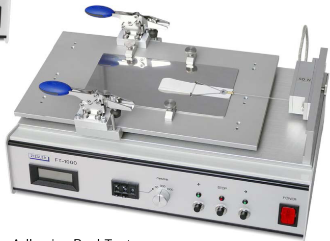
Adhesive Peel Test